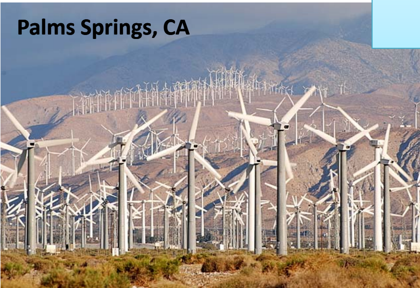
Palms Springs, CA