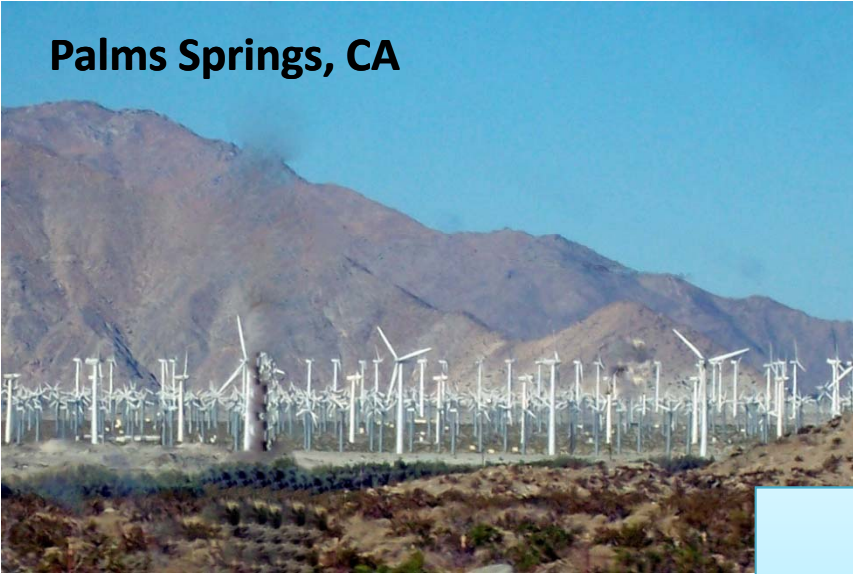
Palms Springs, CA