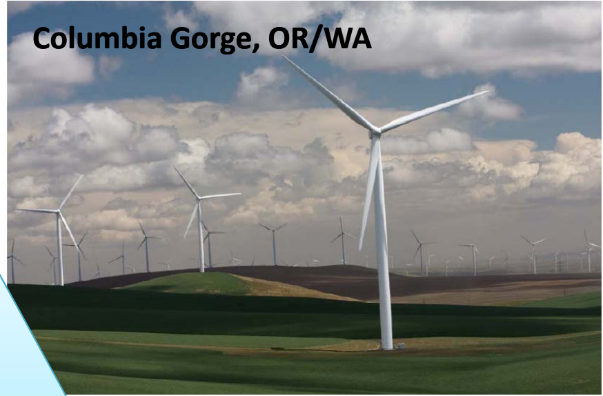
Columbia Gorge, OR/WA